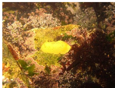
Is this a Lemon Nudibranch?

Ronel found a cray and while we were heading around the point behind the bait house we came across a big shrimp.