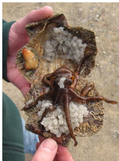
Figure 1: Pygmy Octopus with eggs

Shell and inhabitant were carefully returned to the water.