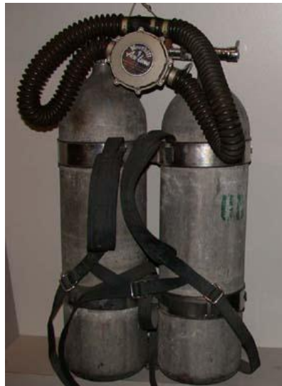
Old twin tanks (not Geoff's)

I first used it off the boulder bank at Kapiti in the days before buoyancy compensators.