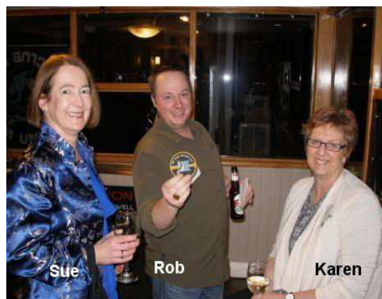
Club members at the pre-dinner mix and mingle prior to the NZUA Annual Dinner on

A big thanks to those involved from Wellington Underwater Club in the running of this event. You did us proud.