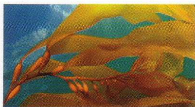
Giant kelp Macrocystis pyrifera

Also, knowledgeable sources say our giant kelp is the same species as in California and Tasmania. In New Zealand, Wellington is the northern range of the species.