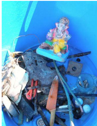
Some of the finds from under the wharf – a statuette, fishing knives, golf balls, wire, bolts to name some

Some of the debris is gear dropped from the wharf, such as fishing knives and tackle. At least one fisherman asked us to look for the knife he'd dropped earlier in the year.