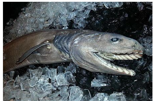
A shark species on display - a frill shark. Primitive, eel-like and 6-gilled.