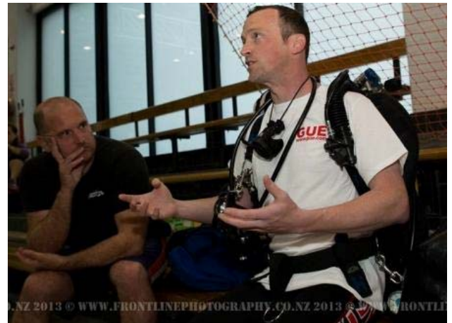
Dry run before the pool session