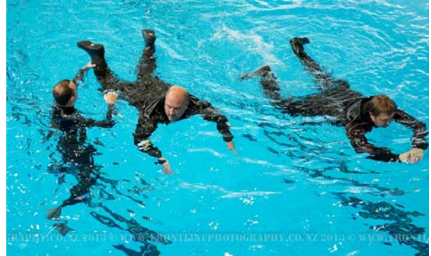
Working on kick technique in the pool