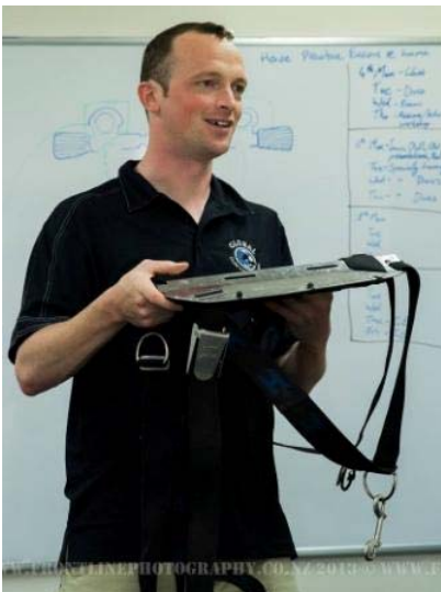
Equipment and theory session