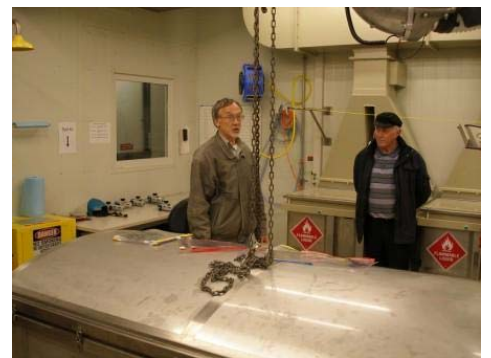
Top: A brief in the Large Tank Storage room.