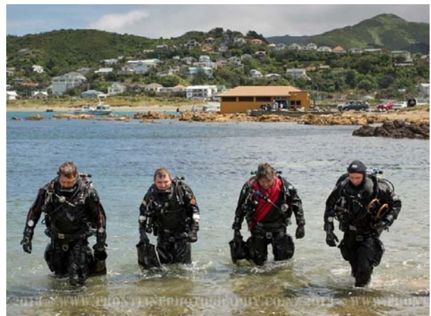
Divers finishing one of the sea dives