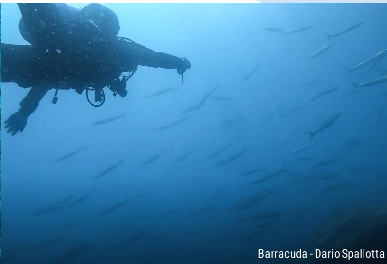
Barracuda - Dario Spallotta