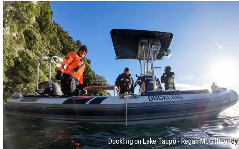
Duckling on Lake Taupō