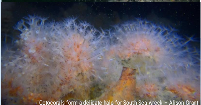
Octocorals form a delicate halo for South Sea wreck – Alison Grant