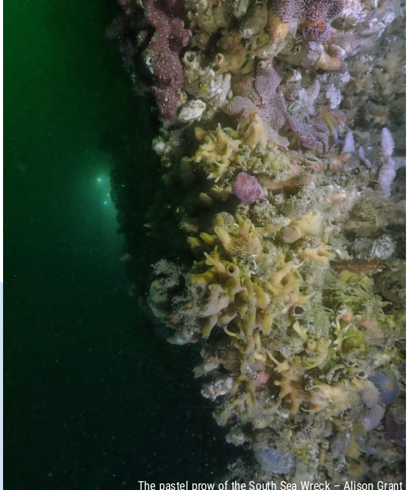
The pastel prow of the South Sea Wreck – Alison Grant

Seasonally I have seen the wreck a refuge for thousands of juvenile sea perch, several per torch beam tucked in the embroidered layers of sponges and ascidians. In another season it was gold-rimmed nudibranches punctuating the wreck in their hundreds. My last dive, the striped anemones were the richest purple and russet orange, and the largest I've ever seen in the species, set off by the delicate white octocorals that colonise the upper edges of the wreck.