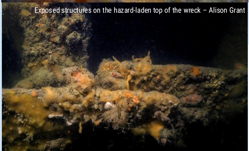
Exposed structures on the hazard-laden top of the wreck – Alison Grant

This is a dive to take slowly. 45 minutes will let you complete a circuit of the wreck and return to the line just ahead of your NDL, stopping to admire a hundred delicate oddities will catch the attention of your light along the way. If you are lucky enough to feel the passing ferry vibrating your bones, you'll wonder yet how the filmy lacework and silk tapestry isn't ripped apart with every passing trip.